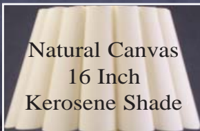
Natural Canvas 16 Inch Kerosene Shade

Seth Andrew 16 Inch Fluted Kerosene Shade shown on Aladdin No. C6183 Amethyst Kerosene Mantle Lamp