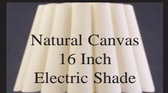
Natural Canvas 16 Inch Electric Shade

NOTE: Aladdin antique electric lamps shown above are for display purposes only and are not sold separately.