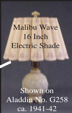
Malibu Wave 16 Inch Electric Shade