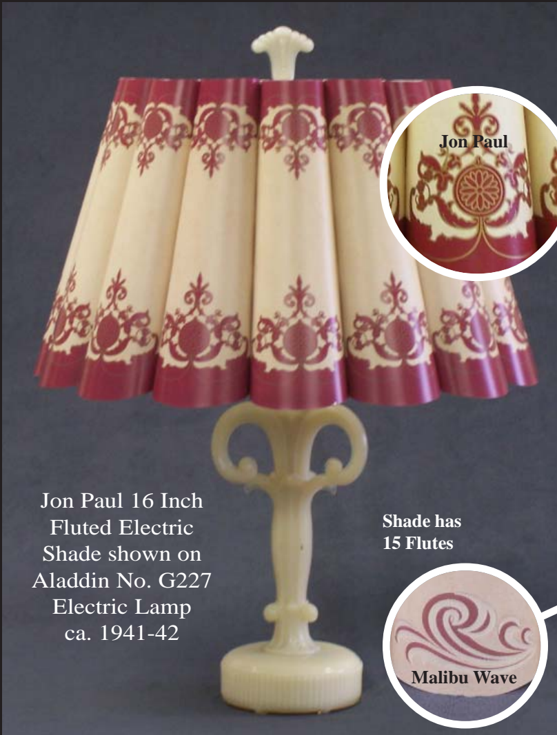
Jon Paul 16 Inch Fluted Electric Shade shown on Aladdin No. G227 Electric Lamp ca. 1941-42

Genuine Aladdin Table Fluted Lamp Shades are authentic in design style to the wonderful line of electric shades produced by The Mantle Lamp Company of America in Chicago during the 1930s. Each Aladdin shade is hand crafted in the USA of high quality materials and is sure to please most every discriminating buyer.