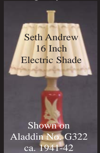
Seth Andrew 16 Inch Electric Shade